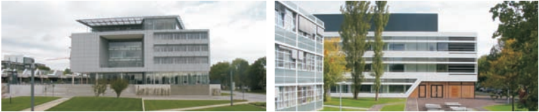
IAS (Institute for Advanced Study) Lichtenbergstraße/Boltzmannstraße